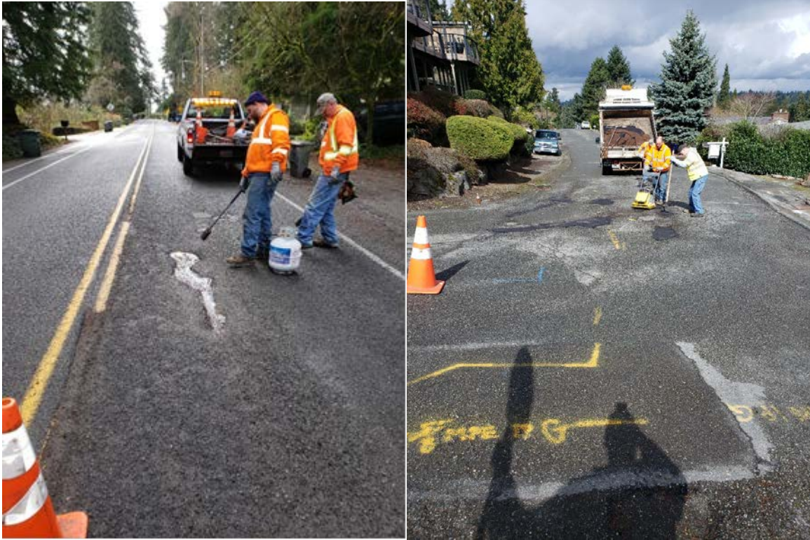
Public Works is trying to take a proactive approach to street repairs with the limit budget since I-976 passage.