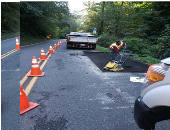
Public Works conducting proactive street repair – cutting out alligator cracking and asphaltting the patch.