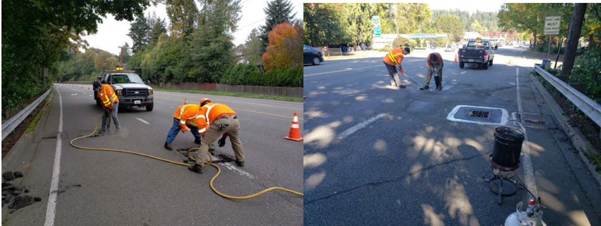
Public Works repairing drainage lids throughout the city.