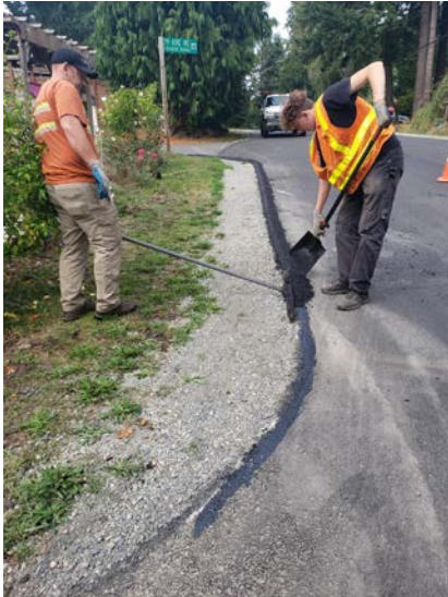
Public Works team adding asphalt berms to better control surface water toward catch basins.