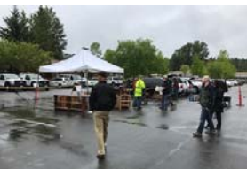
Choose to Reuse—2018

Saturday, June 22, 10:00 a.m. to 2:00 p.m.