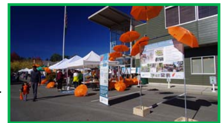
Town Center Open House 2018

As the Town Center project moves forward, your elected